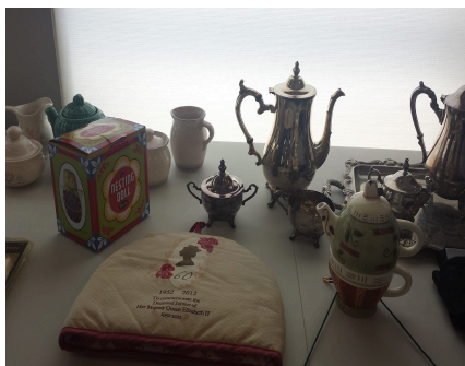
Auction items from the August meeting.

Regency and Mystery books. Over the last 2 weekends in May, the Hendricks Civil Theatre performed a stage version of "Pride and Prejudice". They also had a formal tea with Lady Catherine before the performance. The afternoon I attended, I was afforded (once again) the VIP treatment as I was escorted to my front row center stage seat by Mr Bingley himself! Of course karma came back to bite me as I was dragged up on the stage after the performance for comments! Apparently the cast became very nervous when they found out I was there representing JASNA. Registration opened for this year's AGM on June 3rd and many of us signed up when the site opened at noon. Our next newsletter will be an