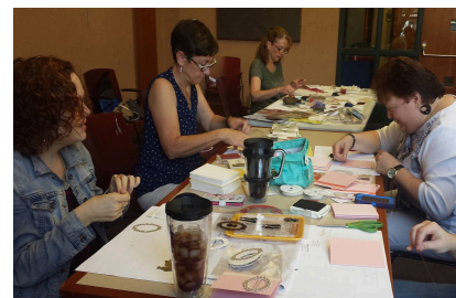
Crafting at the September Meeting!

for us to peddle at the AGM in October. We made notecards, bookmarks, lavender sachets and fancy handbands. And your fearless leader managed to burn her right index finger with the stupid hot glue gun! So much for my crafting abilities!! Thanks again for letting me serve as your Regional Coordinator!