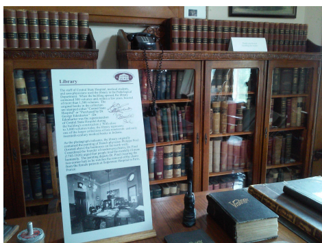
Scenes from the June meeting at The Indiana Medical History Museum.